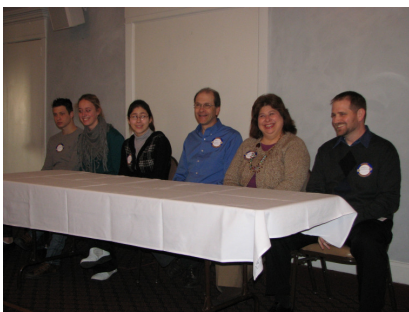
Youth Exchange Panel