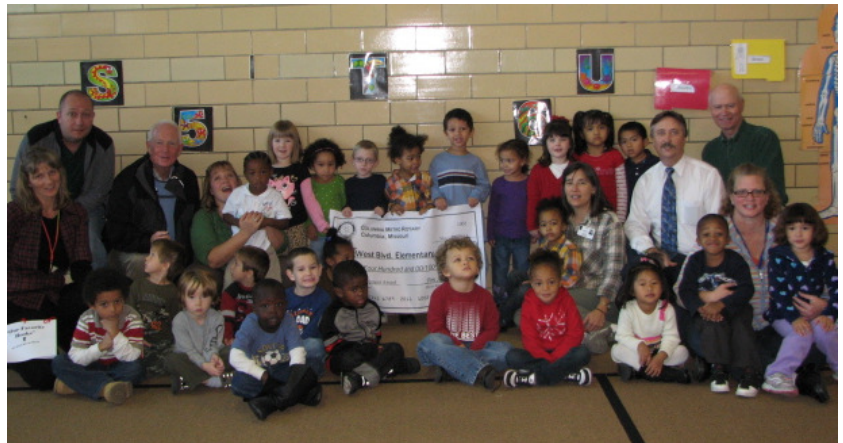
West Blvd. Elementary