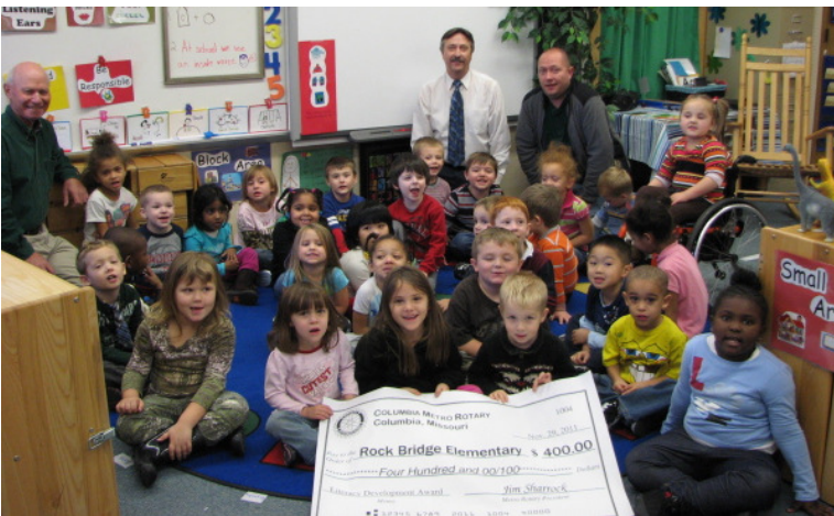
Rock Bridge Elementary