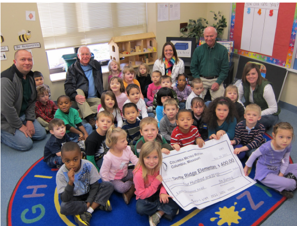
Derby Ridge Elementary

On November 29, 2011, Columbia Metro Rotary presented its annual Literacy Development Awards to four area schools. This year's recipients were Derby Ridge Elementary, West Blvd. Elementary, Rock Bridge High School and Rock Bridge Elementary. Columbia Metro Rotary has been a Partner in Education with the Title I program in the Columbia Public Schools since 2003, and these awards are given annually to help promote literacy and advance student learning. The cumulative award total was $1,500.