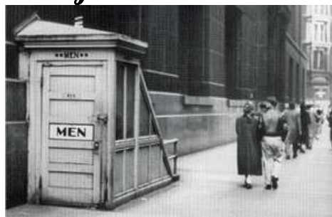
The first Rotary service project was the installation of public toilets in the city of Chicago.