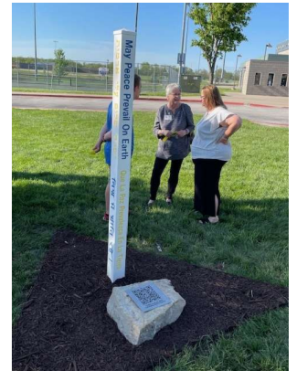
Peace Pole at Battle High School